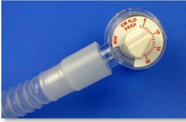
Integral PEEP Valve, 4 – 20 cmH 2 O