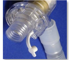
Monitoring Port with Tethered Cap

A complete, lightweight, ready-to-use, non-metallic, non-electrically conductive MRI transport circuit, individually packaged. Compatible with Westmed BagEasy™ Manual Resuscitator and with some portable transport ventilators that have a passive exhalation valve. Features a minimal deadspace non-rebreathing valve with a swivel patient connector, adjustable PEEP valve and a proximal monitoring port that can be used for airway pressure. Available with Adult CO 2 Easy™ Carbon Dioxide Detector: 2-inch diameter indicator is easy to read and the anti-fog lens reduces condensation from exhaled gas. Purple-to-yellow color change allows exhaled CO 2 to be confirmed from a distance.