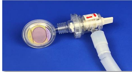
Also Available with CO 2 Easy™ CO2 Detector