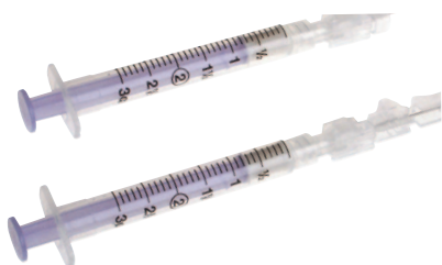
• A line and Cord gas kits