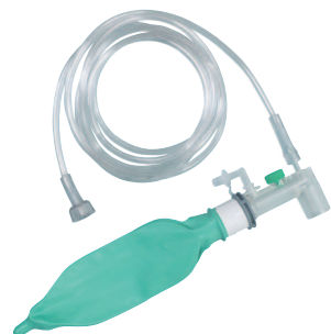
• Hyperinflation sets