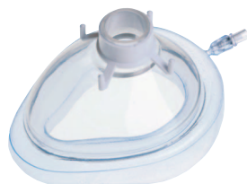
• Westmed disposable face mask